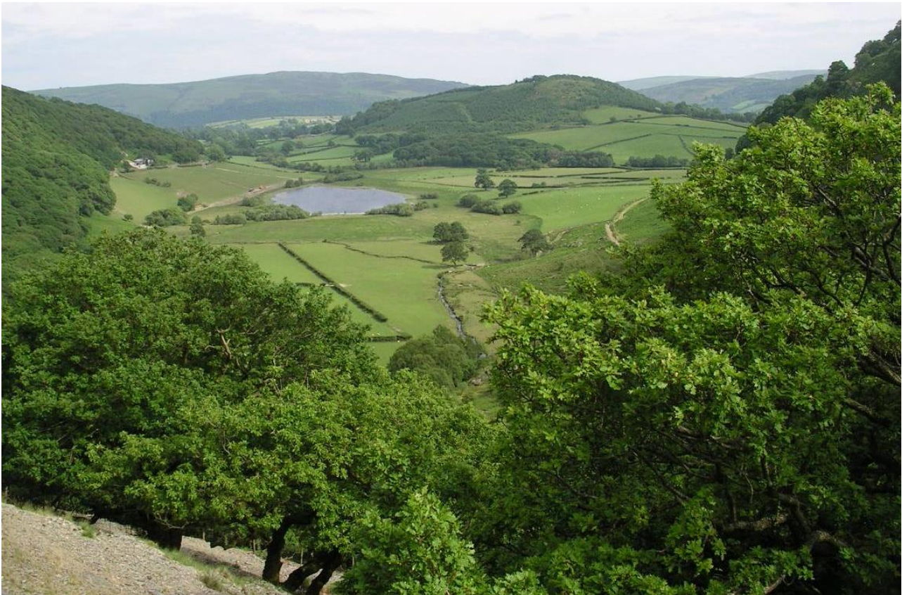
From the mountain road, west of Rhayader, looking across where the valley has become a wide basin, with the hill of Coed-y-Cefn in centre © Bronwen Thomas