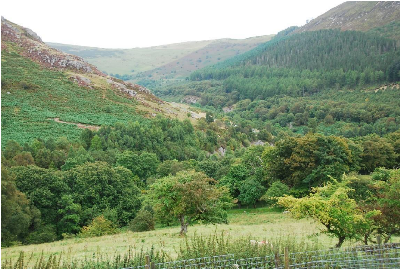
The enclosed, twisting, rugged, wooded valley of the Upper Wye.