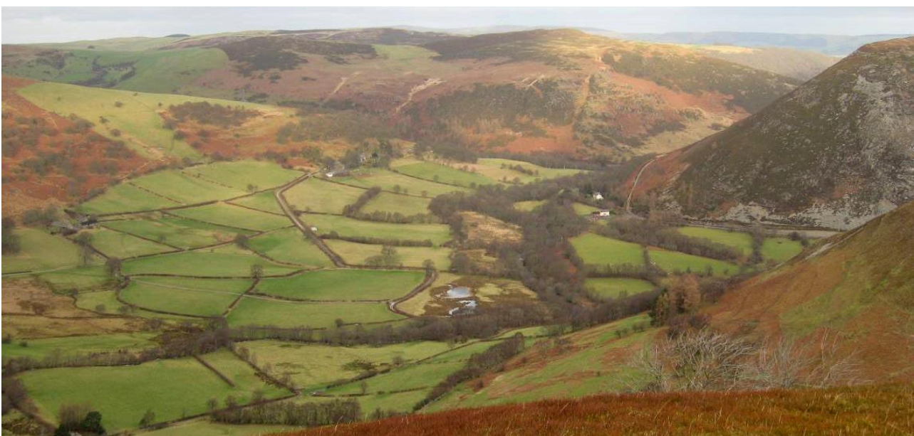
The Wye valley from edge of the Cambrian Mountains at Monks' Trod, above Nannerch.

Rhayader is an attractive, small town, typical of mid Wales, with its bridge over the river and mix of building styles, serving as a local focus. The clock tower forms a distinctive landmark at the junction of the A470 and A 44 at the centre of the town. Downstream of its confluence with the Elan, the Wye becomes a larger and broader river as the valley widens, but constrained in places by ridges as it merges into the broader vales of the Irfon and Ithon area (rLCA27).