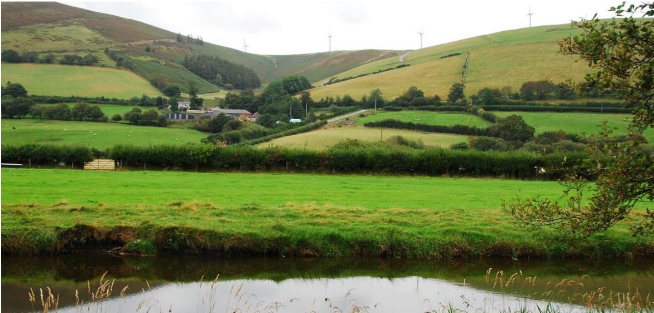
View of one of the gentler valley and river sections in the northern part of the area.