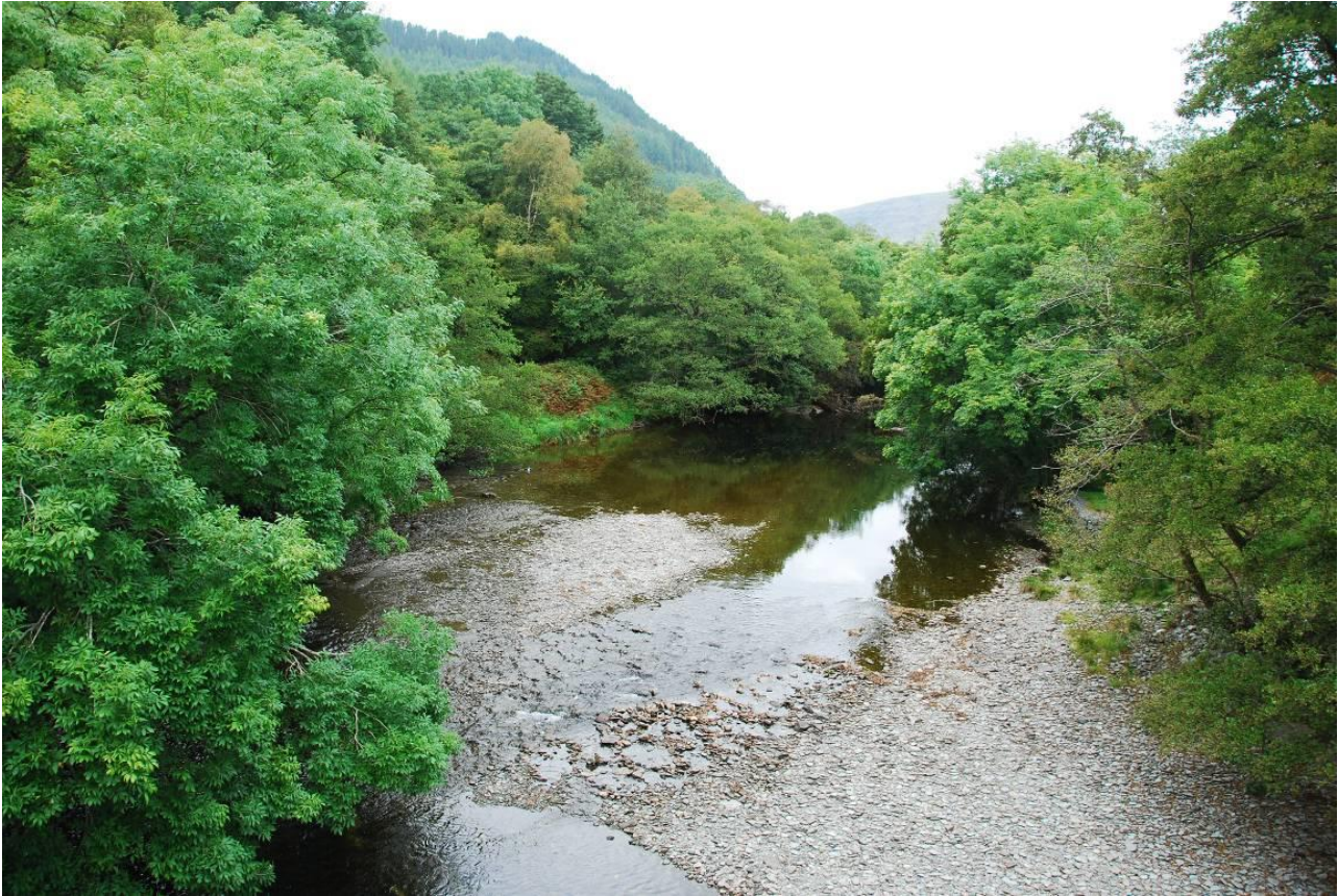
The upper River Wye