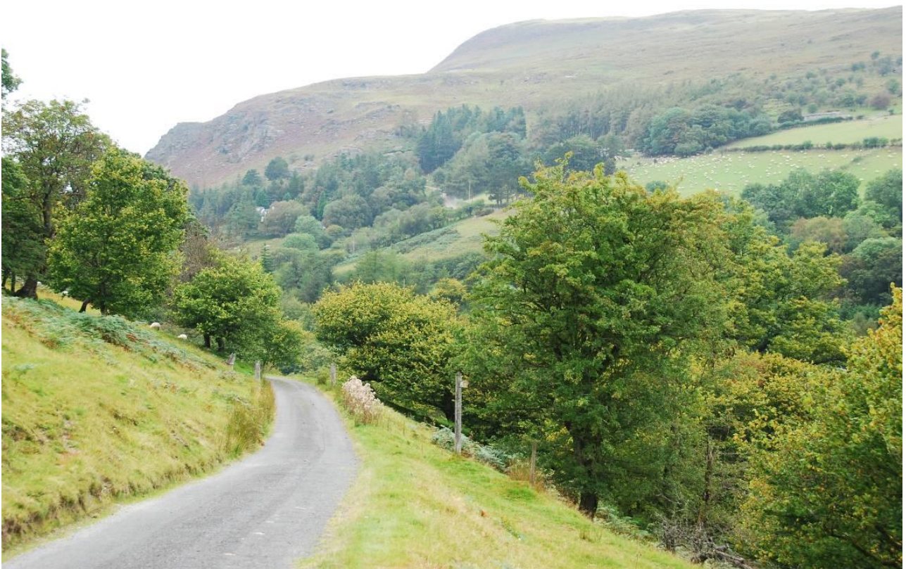
View north from a minor road on the west side of the valley north of Rhayader.