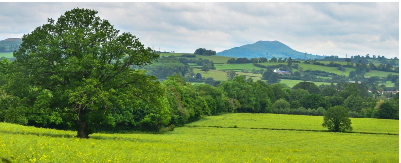
Ysgryd Fawr forms a hill landmark in northerly views from many parts of the Vale of Usk, and a westerly landmark together with the greater backdrop of The Black Mountains from the Vales of Trothy and Monnow.