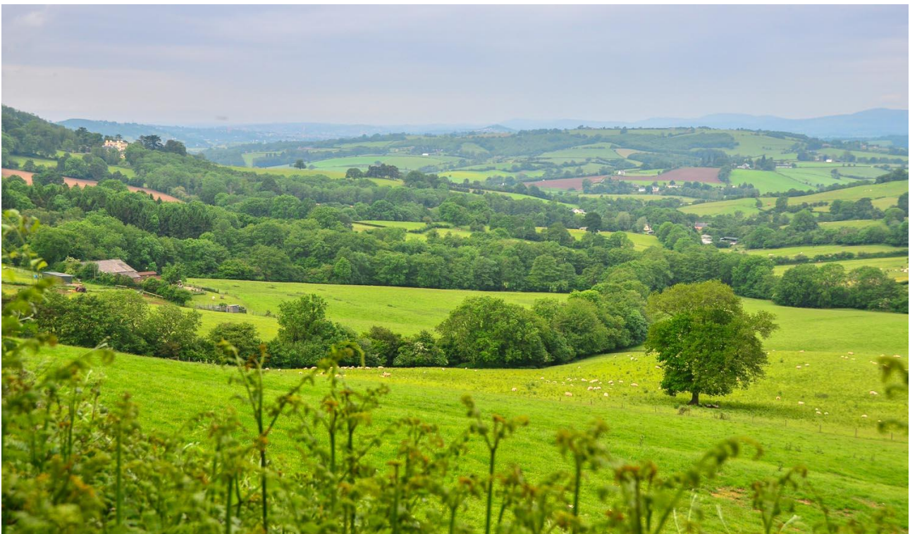
The lower Vale of Usk from the lower slopes by Wentwood Forest