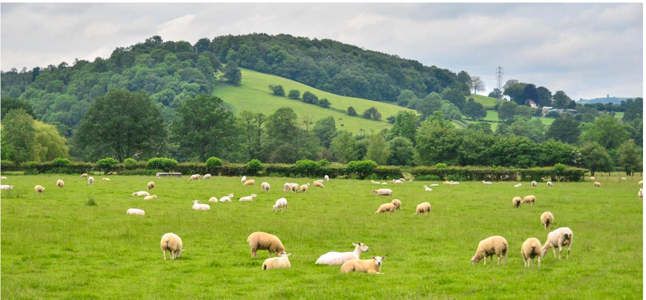
The river flood plain meadows near Usk