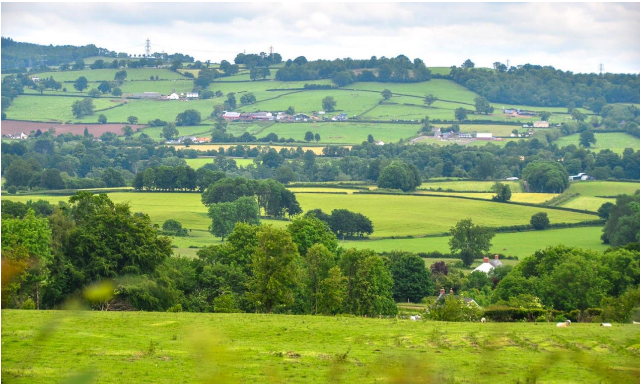
Near Llanover Pencroesoped