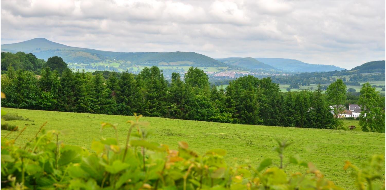
Looking towards The Black Mountains (Sugar Loaf, left) from near Llanvihangel Gobion

The villages and hamlets have a distinctive vernacular style in Old Red Sandstone and whitewashed cottages with slate roofs. In open country, whitewashed farmhouses stand out against the green backdrop of pastured fields and woodlands. Multi-coloured rendered houses are a particular feature of the larger settlements such as Usk. Modern expansion at Pontypool to the west and also at some of the smaller, historic settlements create visible distractions in this otherwise, overwhelmingly rural landscape.