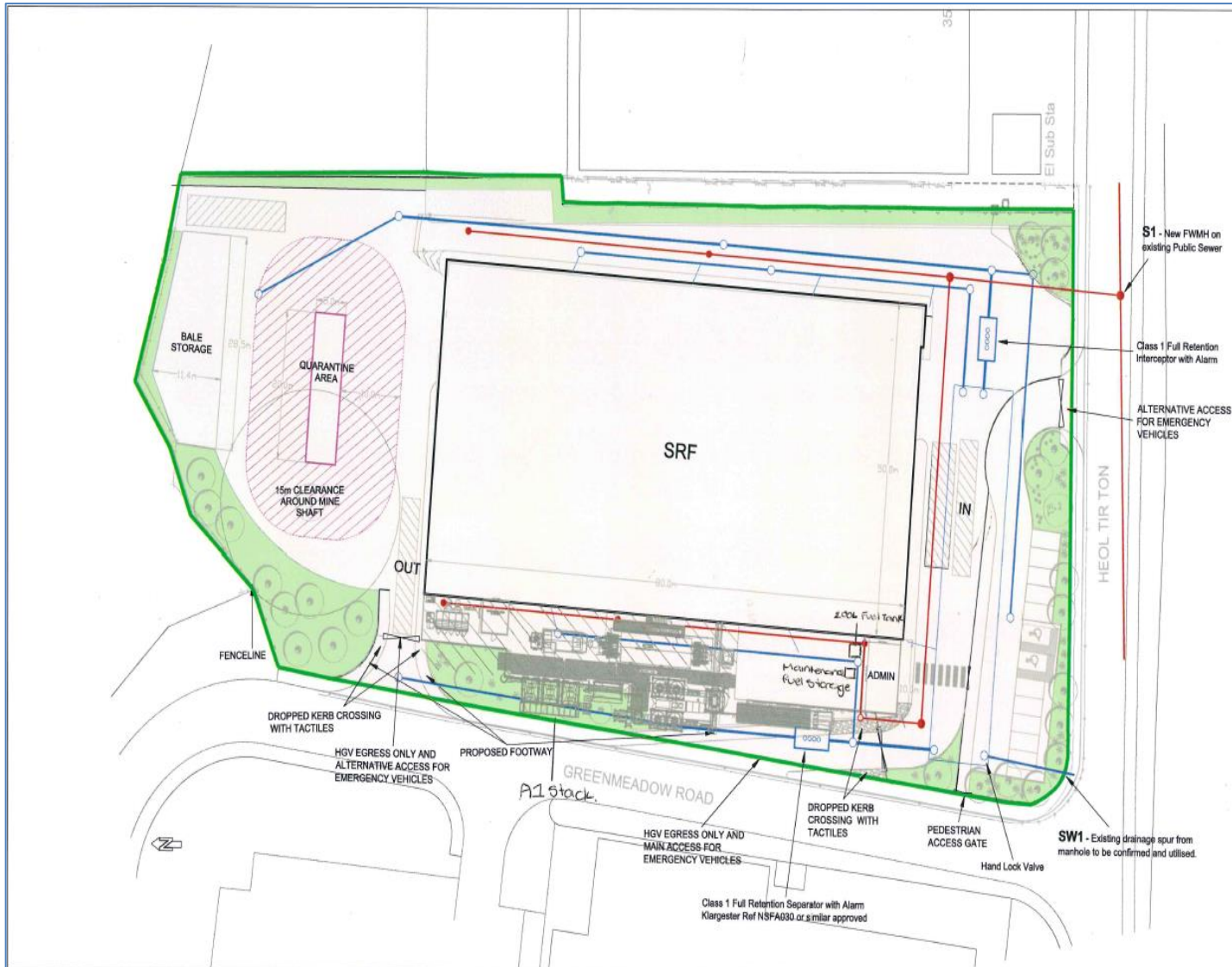
Figure 1: Site Layout