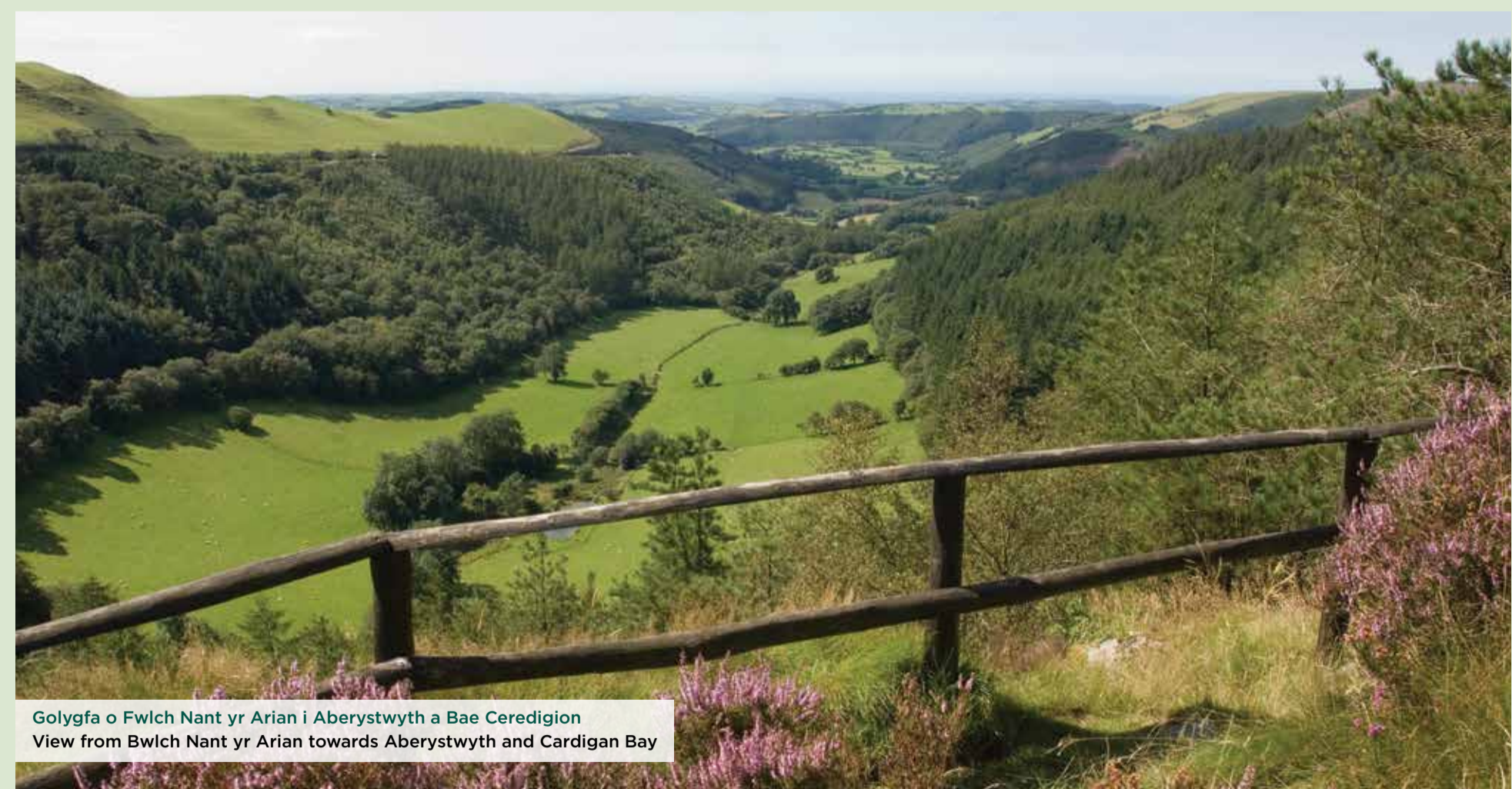
Golygfa o Fwlch Nant yr Arian i Aberystwyth a Bae Ceredigion View from Bwlch Nant yr Arian towards Aberystwyth and Cardigan Bay

Natural Resources Wales is proud to look after some real gems in this scenically dramatic yet tranquil part of Wales.