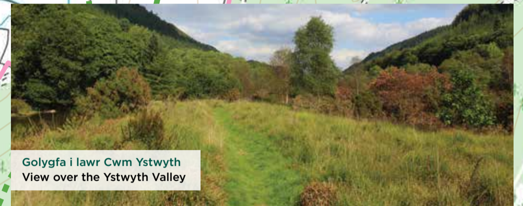
Golygfa i lawr Cwm Ystwyth View over the Ystwyth Valley

Atgynhychir y map hwn o ddeunydd yr Arolwg Ordnans gyda chaniatâd Arolwg Ordnans ar ran Rheolwr Llyfrfa Ei Mawrhydi. © Hawlfraint y Goron a hawliau cronfa ddata 2018 Arolwg Ordnans 100019741. This map is based upon Ordnance Survey material with the permission of Ordnance Survey on behalf of the controller of Her Majesty's Stationery Office © Crown copyright and database rights 2018 Ordnance Survey 100019741.