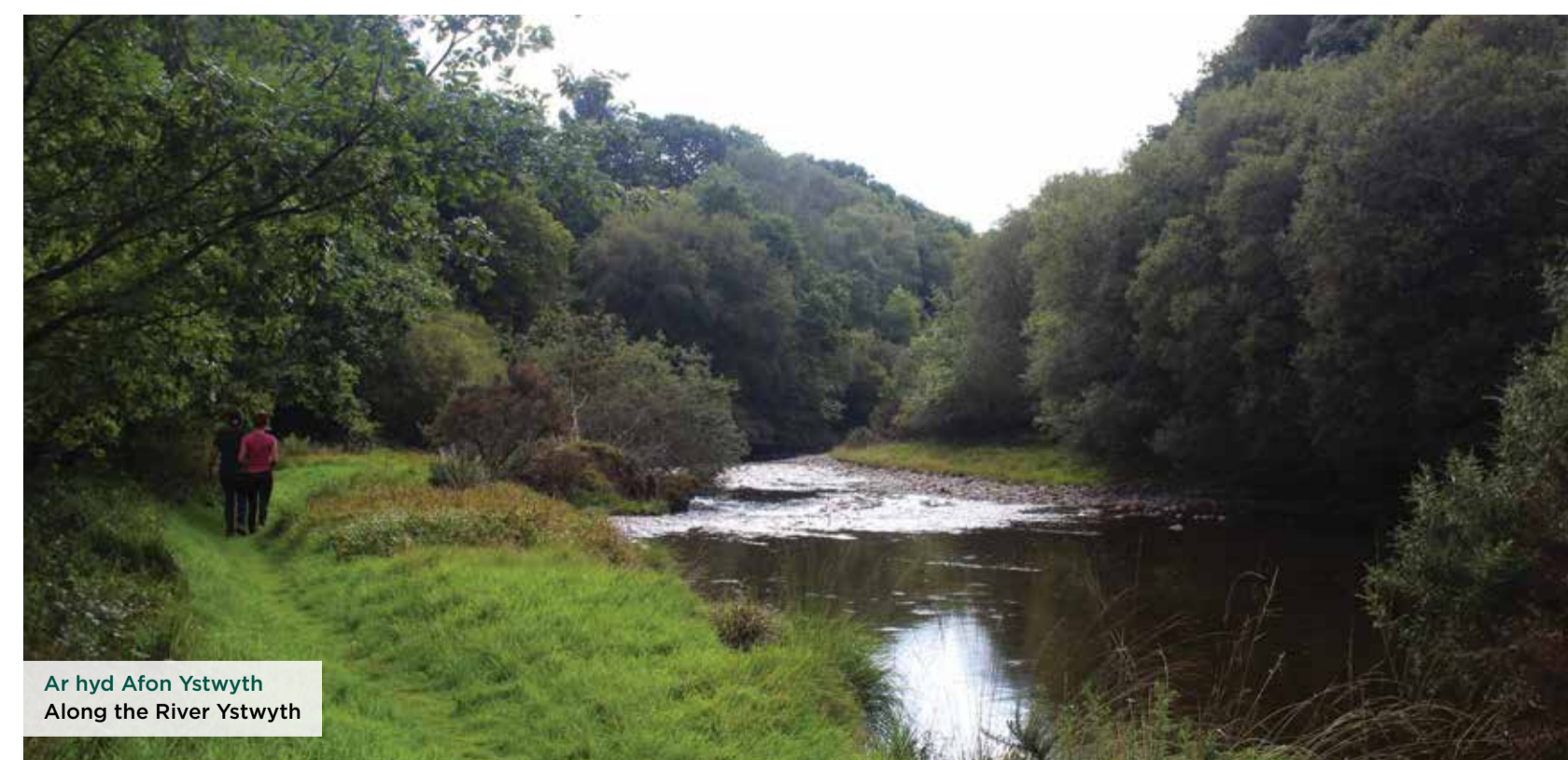
Ar hyd Afon Ystwyth Along the River Ystwyth

Atgynhychir y map hwn o ddeunydd yr Arolwg Ordnans gyda chaniatâd Arolwg Ordnans ar ran Rheolwr Llyfrfa Ei Mawrhydi. © Hawlfraint y Goron a hawliau cronfa ddata 2018 Arolwg Ordnans 100019741. This map is based upon Ordnance Survey material with the permission of Ordnance Survey on behalf of the controller of Her Majesty's Stationery Office © Crown copyright and database rights 2018 Ordnance Survey 100019741.