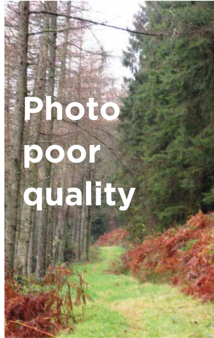
Photo poor quality