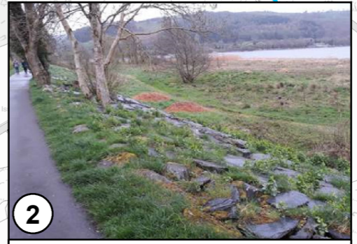
2 LAKE EMBANKMENT, LOOKING EAST ACROSS THE PROTECTED SITE; EVIDENCE OF RECENT WILLOW SCRUB CLEARANCE

Contains Natural Resources Wales information © Natural Resources Wales and Database Right. All rights Reserved. Contains OS data © Crown Copyright and database right 2018