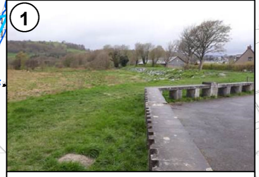
1 LAKE EMBANKMENT LOOKING WEST ACROSS THE PROTECTED SITE, FROM THE 'BANDSTAND' SEATING AREA