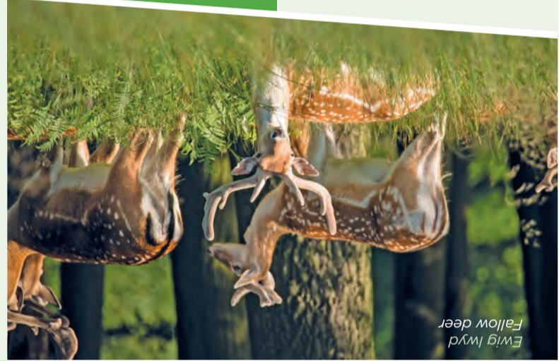
Elwng lwyd / Fallow deer

Woodland with an ancient pedigree Wentwood has a long and illustrious history spanning over 1,000 years. It was once the hunting preserve for Chepstow Castle, whose inhabitants really made the most of the expansive land for their grand hunts. Ancient tracks, charcoal hearths and remains of an old mill also give us some idea of its past industrial use. Wentwood was one of the first woods in the UK to be planted with conifer trees as far back as the 1700s. Since then, and especially during the first and second world wars, much of the remaining native woodland was felled for timber. These areas were largely replanted with quickgrowing non-native conifer trees to provide a timber resource for the nation. Coed Gwent oedd un o'r coedwigoedd cyntaf yn y DU lle planwyd coed conifer cyn belled yn ôl â'r 1700au. Er hynny, ac yn enwedig yn ystod y ddau ryfel byd, catodd llawer o'r coetir prodorol ei gwmpo i'w ddefnyddio yn bren. Ailblannwyd yr ardal oedd hyn gyda choed conifer nad oeddent yn tyfu'n gyflym er mwyn darparu adnodd pren ar gyfer y genedl.