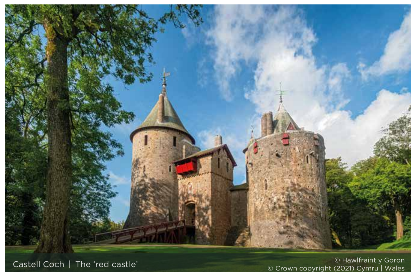
Castell Coch | The 'red castle'