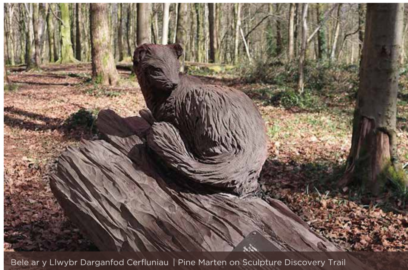
Bele ar y Llwybr Darganfod Cerfluniau | Pine Marten on Sculpture Discovery Trail