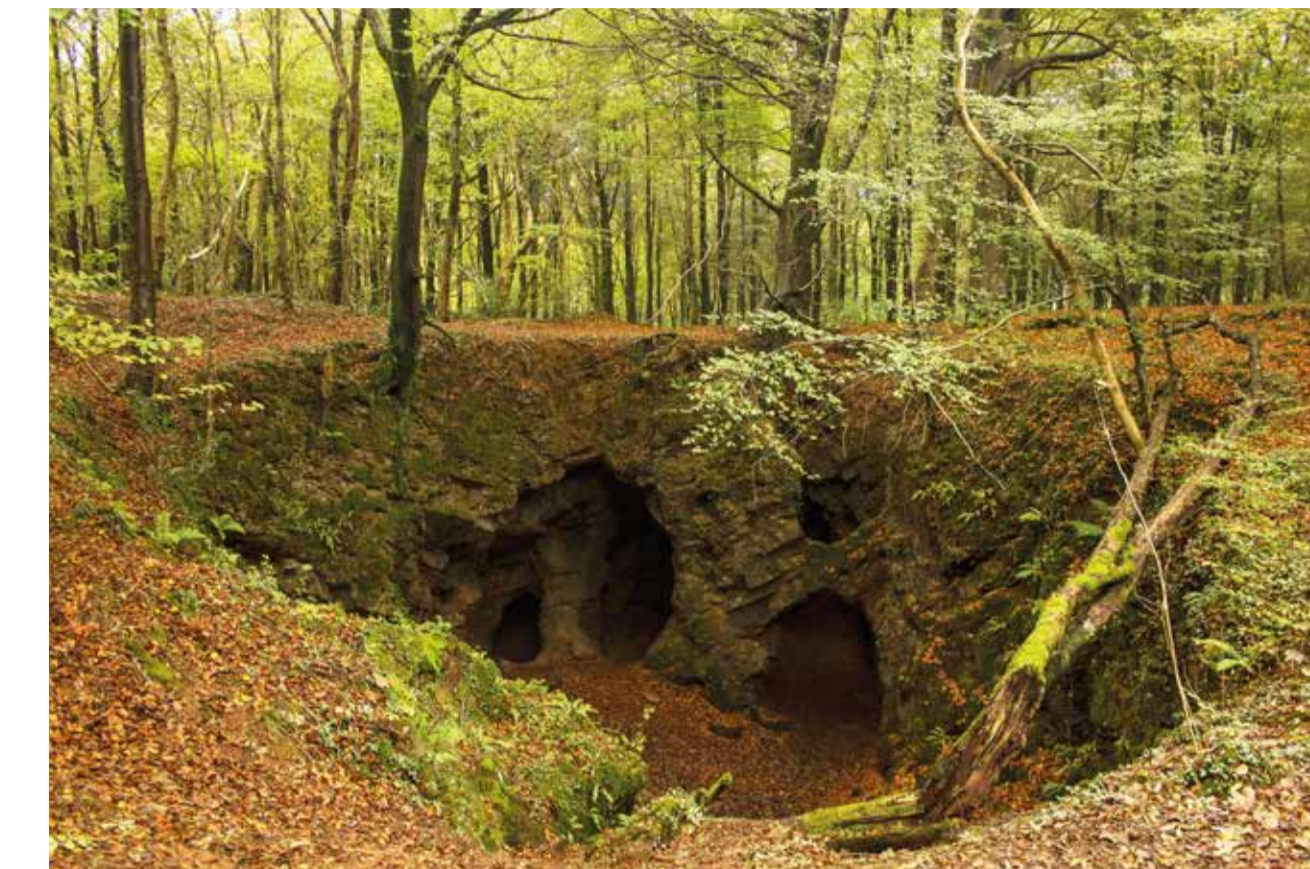
Ogof y Tair Arth | Three Bears Cave

Explore this gateway to Castell Coch Fforest Fawr is the woodland backdrop to the famous Castell Coch. This mixed woodland is renowned for its display of bluebells, wood anemones and wild garlic in the spring. We are gradually returning it to native broadleaved woodland. Did you know that Fforest Fawr is frequently used as a film location for productions ranging from Welsh historical dramas to children's TV programmes like Merlin and Sherlock ? Castell Coch - the 'red castle' that rises from the forest Built on the ruins of a medieval castle, Castell Coch is an excellent example of Victorian Gothic Revival. The castle has a commanding view of the Taff Gorge and is a landmark on the A470 - dramatically rising out of Fforest Fawr's beech woods. Please note that the toilet facilities and tearoom are only for visitors who have paid the entry fee. For more information on opening hours, please visit www.cadw.wales.gov.uk