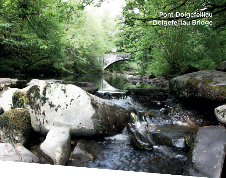
Pont Dolgefeiliu Dolgefeiliu Bridge